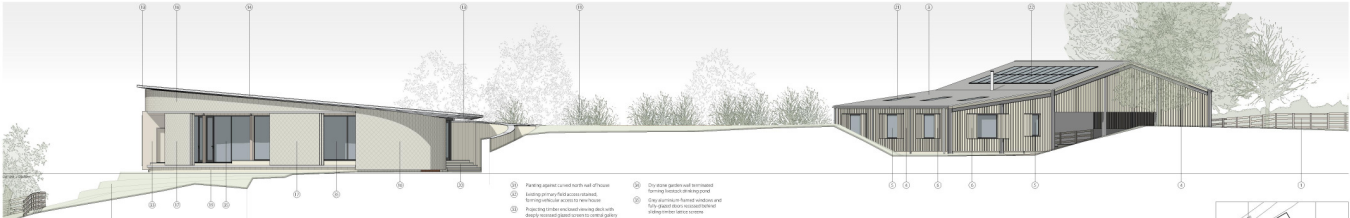
EAST-FACING ELEVATION 1:100 01/2020