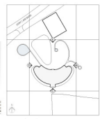
KEY PLAN 1:100 01/2020